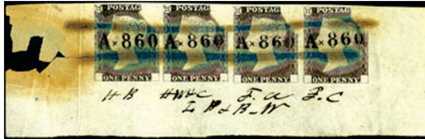
A Cancellation Trial from early June 1840 1d showing a row of four with the stamp impressions in deep lilac brown and “Ax860” cancels, endorsed by Joshua Bacon for various chemical treatments that had altered the color of the stamps and stained the paper.