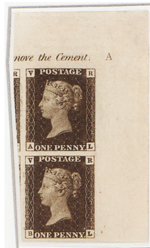
This "V R" Official (Sc. O1) corner margin piece shows the "V R" (Victoria Regina) letters instead of ornaments in the top corners and a (A in this case) instead of a plate number