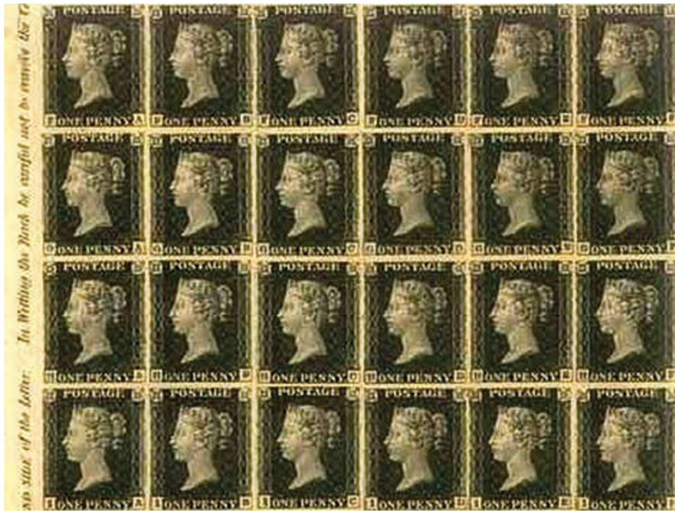
A part sheet showing a portion of the instructions for use of the stamps.

The prepaid letter sheets, with a design by William Mulready, were distributed in early 1840. These Mulready envelopes were not popular and were widely satirized. (Ac-