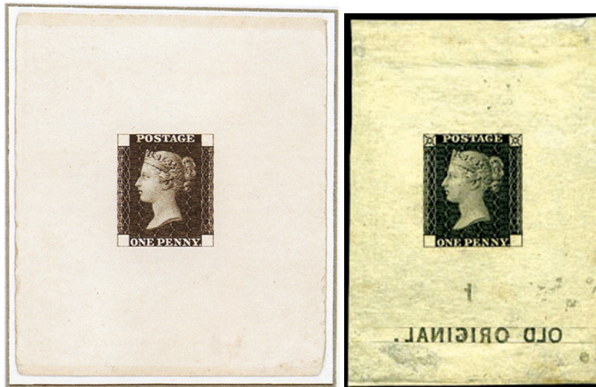
Left, a March 1840 die proof in black on India paper taken after the top and bottom labels had been engraved, but with the four corners blank. Right, an approved Perkins Bacon die proof with the top corner ornaments and "1 / OLD ORIGINAL" engraved below, in black on wove paper.

In the margins in the four corners of the sheet were the plate numbers 1 to 11 as exactly eleven plates were used to produce the penny