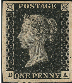
Great Britain #1

The Post Office of Great Britain as a state monopoly dates from the time of Queen Elizabeth I, who reigned from 1558 to 1603, although it was not fully established until 1609, and more than two centuries later that Britain became the first nation to issue postage stamps. This took place a few years after Queen Victoria acceded to the throne and began