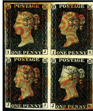
In this IJ/JK block of four, we see the stamps from the stamps from the 9th and 10th rows and the 10th and 11th columns.

The color of the stamp was changed less than a year after the Penny Black was issued. It was found that the black color meant that a black cancel could not be used and that the red ink used instead sometimes could not be seen and could be washed off. So the Penny Black was replaced by the Penny Red on February 10, 1841. The black canceling ink that could then be used was easier to see and harder to remove.