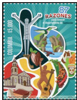
Colombia 2019 Santander, "87 Reasons to get to know Santander"

In 2003 a minisheet with 12 different stamps (next column) presenting the department of Santander was issued, and in 2019 a stamp supported the department's campaign, '87 Reasons to get to know Santander'.