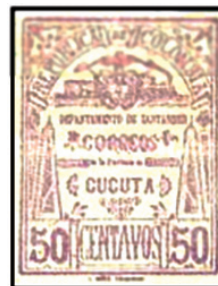
1904 Cucuta 50c