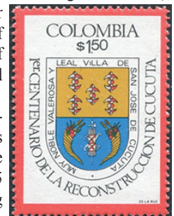
1975 reconstruction of Cucuta 50 years Sc. 835

Cucuta also was the theme of a 1975 stamp showing its city arms and commemorating the centenary of its reconstruction.