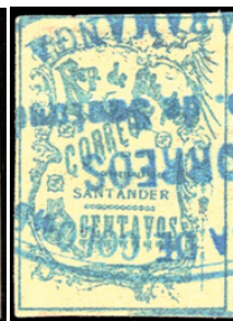
Santander 1905 5c pale blue, Sc. 30