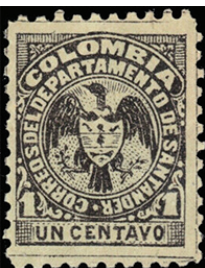
1899, Sc. 16