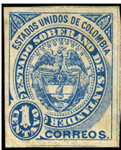
Santander 1884, Sc. 1