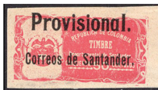
Santander 1903 Provisional, Sc. 19