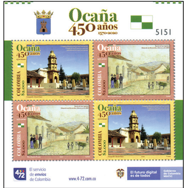
2020 Ocaña 450 years