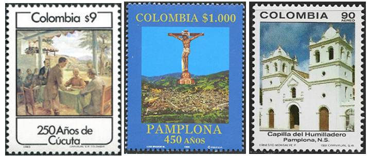
Left to right: 1983 Cucuta 250 years Sc. 920; 1999 Pamplona 450 years Sc. 1155; 1991 church in Pamplona Sc. 1038

The 250th anniversary of the founding of Cucuta was celebrated of a 1983 stamp. The 450th anniversary of the founding of Pamplona was marked on a 1999 stamp and a 1991 stamp showed a church in the city. In 2020 the 450th anniversary of Ocaña was celebrated on a souvenir sheet with two pairs of stamps.