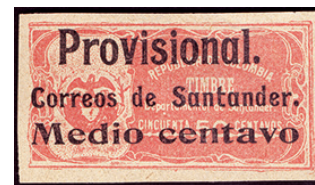
1907 Provisional, Sc. 37

In 1903 a fiscal stamp was converted into a postage stamp with an overprint reading "Provisional. Correos de Santander", and a similar overprint on the same fiscal stamp and surcharged was issued in 1907.