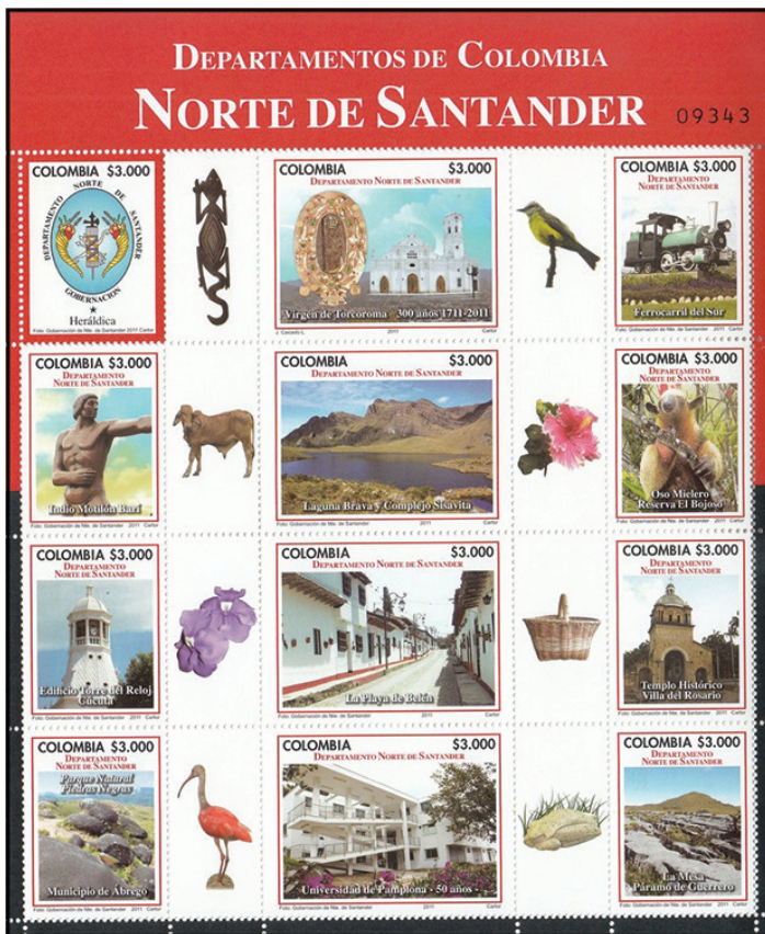
Colombia NS 2011 department of Norte de Santander

The 250th anniversary of the founding of Cucuta was celebrated of a 1983 stamp. The 450th anniversary of the founding of Pamplona was marked on a 1999 stamp and a 1991 stamp showed a church in the city. In 2020 the 450th anniversary of Ocaña was celebrated on a souvenir sheet with two pairs of stamps.