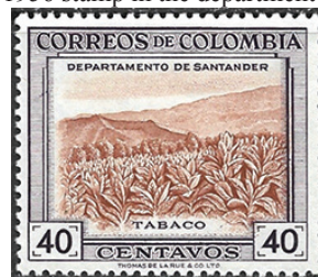
Colombia 1956, Santander coffee Sc. 558; above right, Colombia 1973 Battle of Bombona Sc. C592; right, Colombia 1961 San Gil Sc. C409c