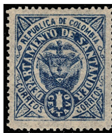
Santander 1889, Sc. 10

Three stamps in slightly different designs were issued in 1889, with additional stamps with the departmental arms being issued in 1892 (1 stamp), 1894 (2 stamps) and 1899 (3 stamps).