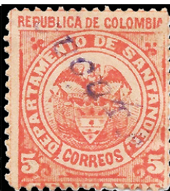
1892, Sc. 13