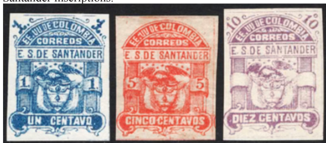
Santander 1886 set, Sc. 4-6

Three stamps in slightly different designs were issued in 1889, with additional stamps with the departmental arms being issued in 1892 (1 stamp), 1894 (2 stamps) and 1899 (3 stamps).