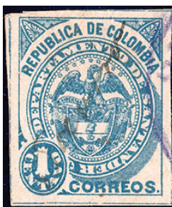
1887, Sc. 7