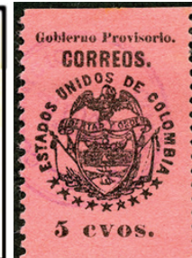
1900 Cucuta Revolutionary issue