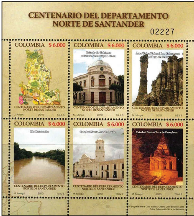
Colombia NS 2010 Norte de Santander centenary