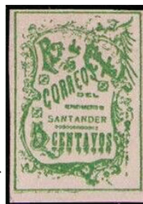
Santander 1904 5c dark green, Sc. 22

Colombian stamp issues with Santander themes or motifs include a 1956 stamp in the department series showing a coffee plantation, a 1973