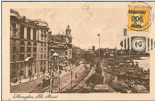
20¢ Offices in China (K10) tied by "U.S. Pos. Service, Shanghai, China, Dec. 7, 1922" duplex datestamp on front of postcard depicting the Bund, waterfront, area in Shanghai.

in 1847 another treaty ceded 356 acres to the French. The so-called "American Concession" was not really a concession at all, but was the name given to the settlement which grew up around the residence of the American consul.