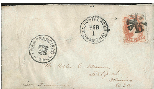
6¢ Dull Pink (Sc. 159) tied by circle of wedges cancel, with “U.S. Postal Ag’cy, Shanghai, Feb. 1” circular date stamp on cover to Illinois, also with “San Francisco Cal. Feb. 28” c.d.s.

establish regular steamship mail service to China. The following authorization was given and is reported in P. L. & R., 1866, Section 192 (17 Feb. 1865, S. 1-13 Stat. 430):