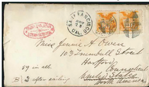
10¢ Yellow (Sc. 116) tied by quartered cork cancels and “San Francisco Cal. Nov. 18” (1870) c.d.s. on cover to Hartford, Conn., also with magenta “China and Japan Steam Service” oval handstamp at left, carried aboard the Pacific Mail Steamship Co.’s “China,” which departed Yokohama on Oct. 23, 1870, and arrived in San Francisco Nov. 17.