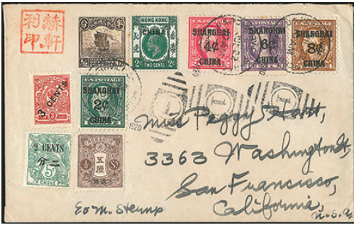
2¢-8¢ Offices in China (Sc. K1-K4) tied by "U.S. Pos. Service, Shanghai, China, Jul. 22, 1920" duplex datestamps on cover to San Francisco, also with Chinese, British Offices, Russian, French and Japanese Offices stamps mostly uncanceled.