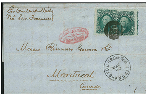
10¢ F. Grill (Sc. 96), one with wide straddle-pane margin, tied by negative mirror-image “20” in circle cancel with “P.O.D. U.S. Con. Genl. Shanghai Mar. 20” c.d.s. on blue 1869 folded letter to Montreal, Canada, also with red “China and Japan Steam Service” double-line oval handstamp and May 8, 1869 Montreal receiving backstamp. The 20¢ postage overpaid by 4¢ the 10¢ transpacific postage and 6¢ U.S.-Canada rate. This cover was carried by branch steamer from Shanghai to Yokohama, where it was placed on board the Pacific Mail Steam Ship “Japan,” which arrived in San Francisco on April 24.

that there were no regularly established mail lines between the United States and China. But by the middle “Sixties,” American interests in the Orient had become so important that the demand for quicker and cheaper postal service caused the Post Office Department to appeal to Congress for authority to