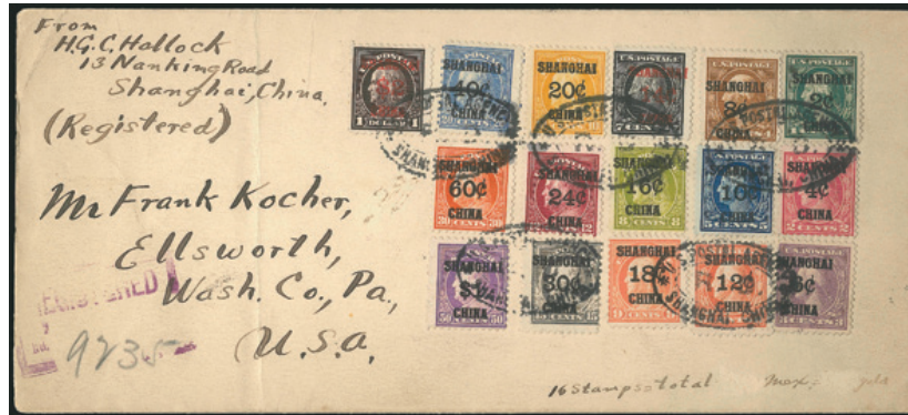
The 2¢-$2.00 Offices in China (Sc. K1-K16), tied by "U.S. Postal Agency, Shanghai China, R.D." oval handstamps on a 1919 registered cover to Ellsworth Pa.

England's monopoly on the China trade was centered in the British East India Company, and, until the Revolutionary War, Americans had to buy all Chinese products (and practically everything else) through the mother country. But once freedom had been guaranteed—even before a stable government had been established for the erstwhile colonists—American merchants and shipping interests laid plans to develop for themselves trade routes to China. These had been denied to them as British colonists. Accordingly, the ship "Empress of Asia" was outfitted, and in 1784-85 became the first American ship to make the round trip to Canton. The voyage was highly successful, and other ships were rapidly put on the "China run." In fact, by 1789, it was reported that at one time there were five American vessels anchored at Canton when eleven more sailed into the harbor.