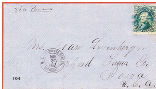
"U.S. Consulate General Shanghai Nov 27 1867" black double circle datestamp pressed into service as a postmark prior to delivery of the regular device, on a cover to Iowa, with 10¢ green (Sc. 68) tied by blue wedges cancel, carried on the Pacific Mail Steamer "China", the earliest reported usage of a U.S. adhesive from Shanghai.