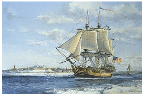
The "Empress of Asia," properly identified as the "Empress of China"

goes back to the year 1015, and it has been a District City since 1360. The ancient native city is surrounded by walls three and one-half miles in circumference, with six gates. The Shanghai of commerce lay outside the walls, and was divided into three main districts: The British, French, and American Concessions. Through the Treaty of Nanking, the British had secured the cession of a site of 5362 acres at Shanghai, and