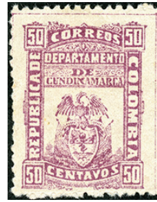
1904 50c, Sc. 33

The stamps of Cundinamarca till 1892 were inscribed State of Cundinamarca, then from 1884 United States of Colombia and State of Cundinamarca, and the 1904 series was inscribed Republic of Colombia and Department of Cundinamarca.