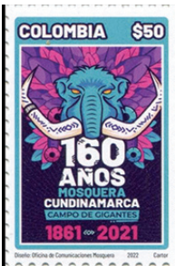
Colombia 2022 Misquera 160 yrs