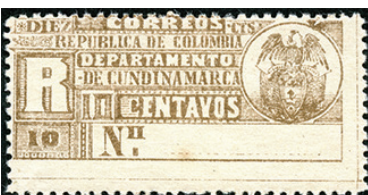
Cundinamarca 1904 Registration stamp, Sc. F2

included a special stamp for registration fee.