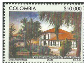
2009 city of Madrid 450 years, Sc. 1322