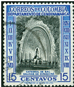
Colombia, 1956 Cundinamarca salt mine chapel, Sc. 653

A bridge in Chia was depicted on a 1991 stamp and in 2005 the city arms of Facatativa appeared on a stamp. The 450th anniversary of a city named Madrid was celebrated on a stamp. In 2022, a single stamp celebrated the 160th anniversary of the city of Misquera.