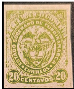
1886, Sc. 20

sued with perforation 10 and imperforate, and a few values were also issued with perforation 10-1/2 and 10-1/2 x 11-1/2. This issue also