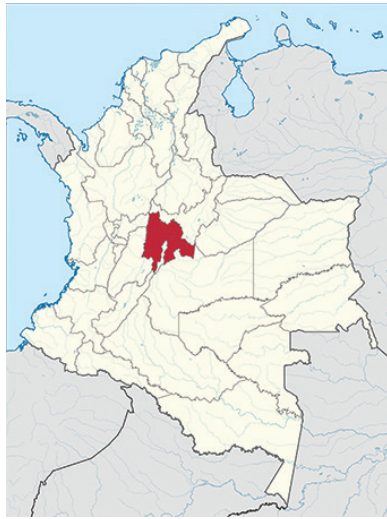
Map of Colombia showing Landlocked Cundinamarca in red

In 1883 simple typeset stamps were issued but new stamps showing the departmen-