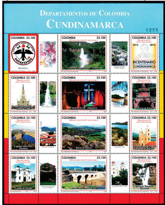
Colombia 2013 Department of Cundinamarca, Sc. 1393