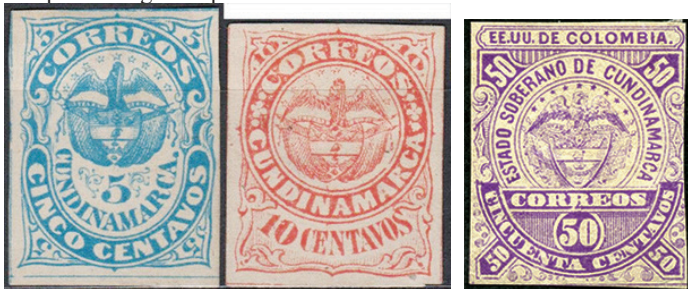
Cundinamarca 1870, Sc. 1-2