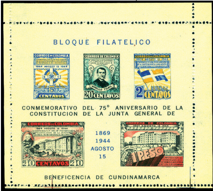
Colombia C 1944 Benevolent Association of Cundinamarca ss Sc. 513

In 1944, the 75th anniversary of the Benevolent Association of Cundinamarca was celebrated with five stamps and a souvenir sheet.