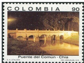
1991 Chia Community Bridge Sc. 1037