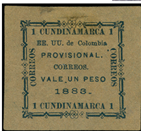
Cundinamarca 1883, Sc. 15

sued with perforation 10 and imperforate, and a few values were also issued with perforation 10-1/2 and 10-1/2 x 11-1/2. This issue also