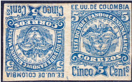
1884 tete-beche pair, Sc. 11a

The last Cundinamarca stamps were a series of ten stamps issued 1904 and again featuring the departmental arms. They were is-