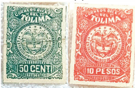
Tolima 1884 50c, 10p, Sc. 30, 34