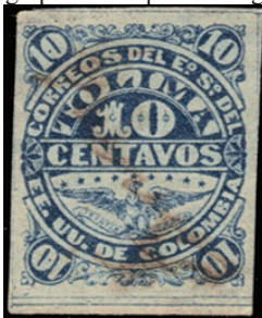
Tolima 1879 10c Sc. 15

followed in 1871 with a set of four lithographed stamps showing the state arms.