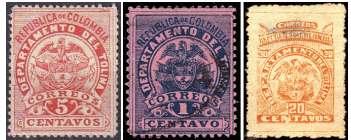
Left to right: Tolima 1888 5c, Sc. 62; 1895 1c, Sc. 66; 1903 20c, Sc. 81

The stamps issued from 1888 had State of Tolima replaced by Department of Tolima.