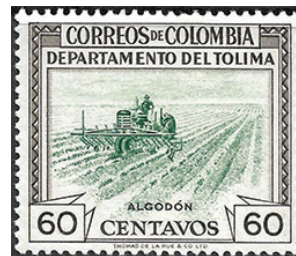
Left, Colombia 1956 Tolima cotton Sc. 660;