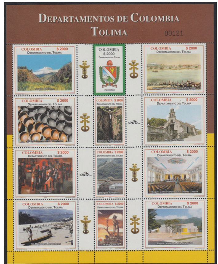
Colombia 2004 department of Tolima Sc. 1225

Colombian stamps with Tolima themes or motifs include a 1956 stamp showing harvesting of cotton, a 2004 minisheet of 12 stamps presenting the department, a 1979 stamp showing the Rio Prado hydroelectric station and a 2015 stamp celebrating the national sports games that were in part held in Tolima.