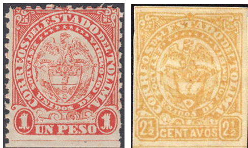
Left, Tolima 1886 1p Sc. 39; right, 1886 two and half c Sc. 46

12 stamps), 1888 (4 stamps), 1895 (6 stamps), and 1903 (8 stamps, all issued imperforate and perforated 12).