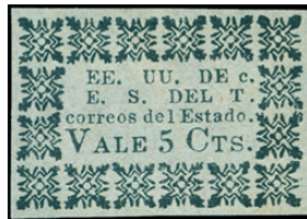
Tolima 1870 5c on bluish paper, Sc. 5

followed in 1871 with a set of four lithographed stamps showing the state arms.