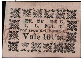
Tolima 1870 10c, Sc. 2