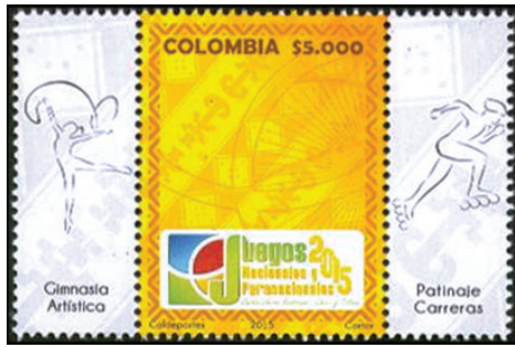
Colombia T 2015 national sports games

Cities of Tolima that have been honored with stamps include the capital Ibagué (1976), Honda (1982), and San Sebastian de Mariquita (1996).