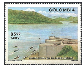
right, Colombia 1979 Rio Prado hydroelectric station Sc. C676

Colombian stamps with Tolima themes or motifs include a 1956 stamp showing harvesting of cotton, a 2004 minisheet of 12 stamps presenting the department, a 1979 stamp showing the Rio Prado hydroelectric station and a 2015 stamp celebrating the national sports games that were in part held in Tolima.