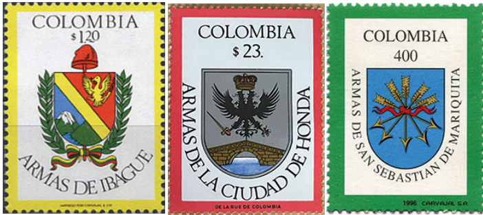
Left to right, Colombia: Arms of Ibague Sc. 833; Honda Sc. 910; San Sebastian de Mariquita Sc. 1122b

Cities of Tolima that have been honored with stamps include the capital Ibagué (1976), Honda (1982), and San Sebastian de Mariquita (1996).