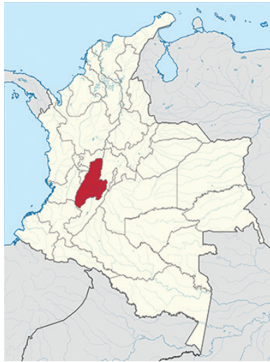
Map of Colombia showing Landlocked Tolima in red

Here, the first two typeset stamps were issued in 1870,