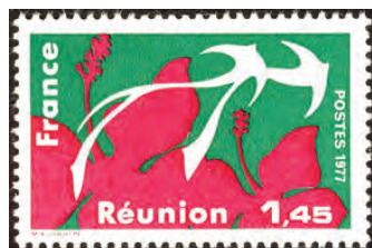
France 1977 for Réunion region (Sc. 1507)

The island changed from a colony to a French overseas département March 19, 1946, and also became a Region from 1974.