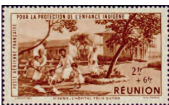
Left, Vichy 1941 Defence of Empire (Sc. B12); right, Vichy 1942 Child welfare semi-postal air stamp (Sc. CB3)