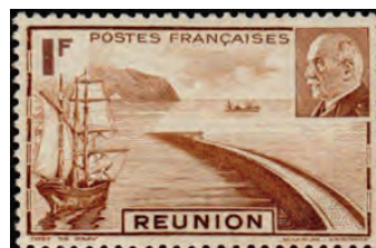
Vichy 1941 Marshall Petain and Saint-Denis (Sc. 176)

An air post issue appeared 1938, which was also re-issued without the RF monogram by the Vichy authorities 1942.