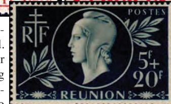
1944 Red Cross and national relief semi-postal (Sc. B15)

In 1943, a number of previous issues were overprinted "France Libre" by the Free French authorities now in charge on the island. London-printed postage and air post stamps were put on sale during late 1943 and early 1944. The London-printed issues of Réunion also included a 1944 semi-postal for the Mutual Aid and Red Cross Funds.