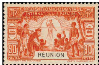
1931 Colonial Exhibition (Sc. 124)

1933-40, now with designs showing the cascade in Salazie, the Anchain Peak, also in Salazie, and the Léon Dierx Museum in Saint-Denis. New values and colors were added 1938-40, and in 1944, the French Vichy regime re-issued two of the values without the RF monogram, but these were never put on sale on Réunion.