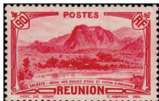
Left: 1933-40 definitive, here Waterfowl Lake and Anchain Peak (Sc. 148); right, Vichy 1944 as 1933-40 issue, but without RF monogram (Sc. 237B)

1933-40, now with designs showing the cascade in Salazie, the Anchain Peak, also in Salazie, and the Léon Dierx Museum in Saint-Denis. New values and colors were added 1938-40, and in 1944, the French Vichy regime re-issued two of the values without the RF monogram, but these were never put on sale on Réunion.