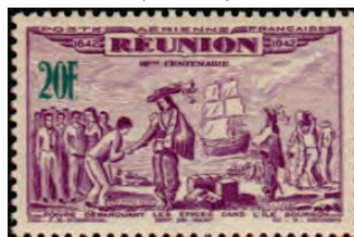
Vichy 1943 300th anniversary of French settlement, air post (Sc. C13F)

a view of Saint-Denis harbor. In 1942 six ordinary and six air post stamps commemorated the 300th anniversary of French rule over the island; also in 1942, two semi-postals in aid of children and one for the imperial week were issued. None of the Vichy issues were ever put on sale on Réunion.