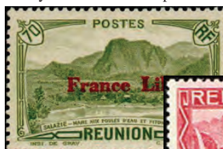
Left to right: 1943 France Libre overprints (Sc. 200, 211, C16)