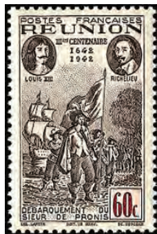
1943 300th anniversary of French settlement (Vichy issue), Sc. 177B

The island has an area of 970 square miles and a population of around 840,000.