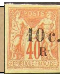
Left to right: French stamp used in Saint-Denis 1886, with "5c / R" overprint; 1885 R overprint and surcharge on French Colonies issue, Sc. 3; 1885 R overprint and surcharge on French Colonies issue, Sc. 7

In 1891, French Colonial stamps were overprinted "REUNION". In 1892, stamps in the colonial 'Peace and Commerce' design, inscribed RÉUNION, were issued.