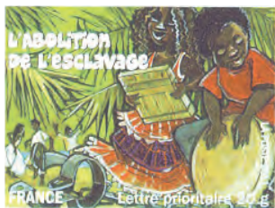
Above: France 2011 – Festivals and traditions of the regions, prestige booklet with self-adhesive stamps, including this relating to Réunion: Abolition of slavery (1848, celebrated each year on December 20)