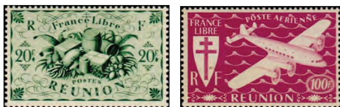
Left: 1943 France Libre issue (Sc. 237); right: 1944 Free French air post stamp (Sc. C24)

In 1945, several of the Free French issues were surcharged with new values, and Réunion also participated in the omnibus issue honoring Governor-General Eboué, and in 1946 in the Victory issue and the air post issue entitled "From Chad to Rhine".