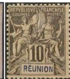
Left to right: 1891 Reunion overprint and surcharge, Sc. 31; 1891 Reunion overprint, Sc. 27; 1892-05 Peace and Commerce inscribed Reunion, Sc. 37,39

Pictorial definitives were issued 1907, with designs featuring a map of the island, a view of Saint-Denis or a view of St. Pierre and the Dolomieu volcano crater. These were re-issued 1922-25 with new values and colors, and during 1928-30, again in new colors. In between,