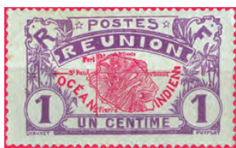
Left: 1907-30 definitive, Sc. 60; upper right: 1907-30 definitive, Sc. 98; right: 1915 semi-postal, Sc. B2

numerous provisional surcharges on previous issues appeared.