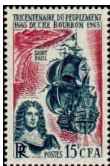
1965 300th anniversary of settlement of Réunion, inscribed CFA (Sc. 356)

During WWII, the island adhered to the Vichy Regime until November 30, 1942, when Free French Forces took over the island.