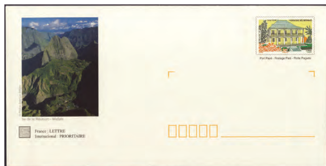
France 2006 pre-stamped envelopes with motif from Réunion, and only sold at post-office on the island (stamp imprint is a modified version of France Sc. 2636 showing the office of the under-prefecture at Saint-Pierre, Réunion, issued 1998)

Réunion issued postal cards from 1892 until 1923, and letter-cards and pre-stamped envelopes, also from 1892. In 1960 and 1971, French aerogrammes were issued with CFA surcharges for use on Réunion, and in recent years, pre-stamped envelopes have been issued specifically for sale on Réunion (albeit valid for postage throughout France).