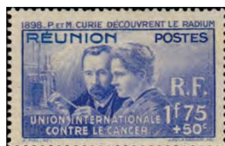
Left: 1938 Curie semi-postal (Sc. B4); upper right: 1937 Paris International Exposition (Sc. 158); right: 1937 air post stamp for flight of 'Roland Garros' from Reunion to France (Sc. C1)

During 1937-38, Réunion participated in the French colonial omnibus issues for the international exhibition in Paris, the Pierre and Marie Curie semi-postal, the New York International Fair and the 130th anniversary of the French Revolution.