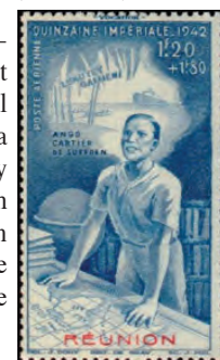
Vichy 1942 Colonial education fund (Sc. CB4)