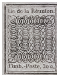
1852, Sc. 2

March 1852 until 1859, when the general issues for the French Colonies were introduced.