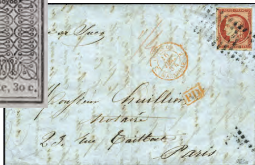
France 1 Franc carmine tied by band of square dots cancel on a letter from St. Denis Reunion with c.d.s. of St. Denis dated 2 Oct 54 on the reverse. Addressed to Paris, via Suez.

For all other correspondence, unoverprinted stamps of France were used from