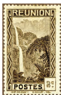
1933-40 definitive Cascade of Salazie, Sc. 127

A completely new pictorial definitive issue appeared