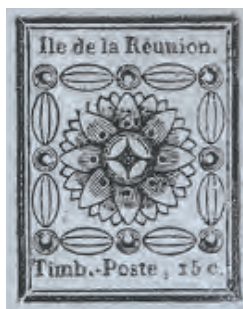
1852, Sc. 1

On January 16, 1852, Réunion issued its first two locally printed stamps, intended for use on inland correspondence and for mail to Mauritius. These two stamps were