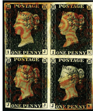
In this IJ/JK block of four, we see the stamps from the stamps from the 9th and 10th rows and the 10th and 11th columns.

The color of the stamp was changed less than a year after the Penny Black was issued. It was found that the black color meant that a black cancel could not be used and that the red ink used instead sometimes could not be seen and could be washed off. So the Penny Black was replaced by the Penny Red on February 10, 1841. The black canceling ink that could then be used was easier to see and harder to remove.