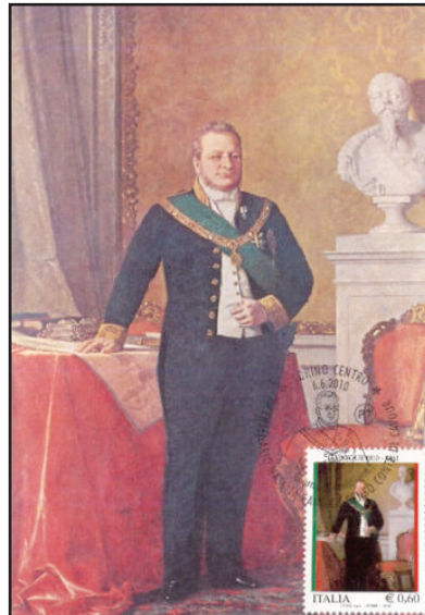
Maximum card for the 2010 first day of issue for the Italy single picturing Camillo Benso.