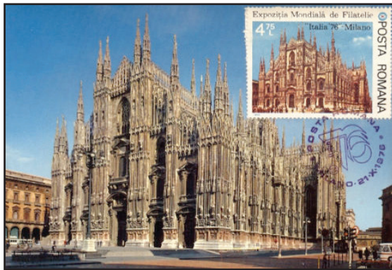
Maximum card for Romania Sc. 2658, for the Italia 1976 International Philatelic Exhibition, pictures the Duomo di Milano.

The capital of Lombardy is Milan, “the fashion capital of Italy” and one of the fashion capitals of the world. One of its many great architectural attractions is the Duomo di Milano.