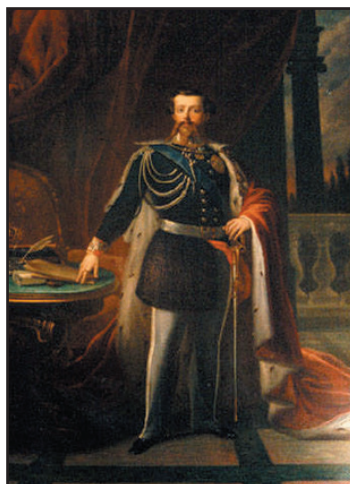
Sc. 31 1863 40c, King Victor Emmanuel II

and Southern Italy. King Victor Emmanuel II of Piedmont-Sardinia from the House of Savoy was then declared King of Italy. This title had been out of use since the abdication of Napoleon I of France on April 6, 1814....