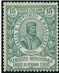
Giuseppe Garibaldi. The stamp is Sc. 118, from a 1910 set of two for the 50th Anniversary of the plebiscite of the southern Italian provinces.

After the Revolutions of 1848, the apparent leader of the Italian unification movement was Italian revolutionary Giuseppe Garibaldi. He was popular amongst southern Italians.... Garibaldi led the Italian republican drive for unification in