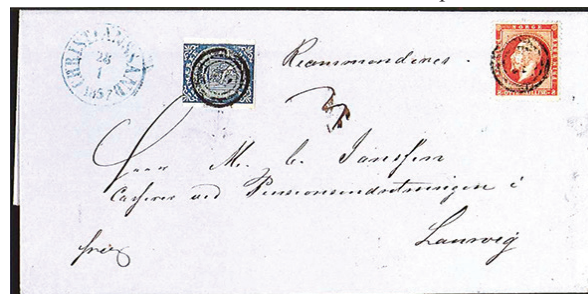
1857 cover from Christianssand to Laurvig with blue January 28 cds, the only known first issue mixed franking with the 1855 4sk (Sc. 1) paying the domestic rate and Oscar 8sk (Sc. 5) paying the registered fee.

The cheap appearance of these stamps, the lack of perforation and the poor gumming, even as soon as three weeks after the first stamp was issued, led the Post Office Department to make inquiries as to whether the production of stamps could be undertaken in London. An estimate was obtained from Messrs. De La Rue & Co. but was considered too costly, so negotiations were entered into with firms in Sweden. In December, 1855, a contract was entered into with P. A. Nymann, an engraver of Stockholm, who delivered the first lot of a new 4sk stamp on June 5, 1856.