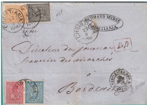
Cover to Bordeaux with 1867 1sk, 2sk, 4sk and 8sk, Sc. 11, 12, 14, 15, tied by Christiania August 27, 1868 circular date stamps.

The 2 and 4sk stamps were the first to appear in June, 1867, and were printed on the same paper as used for the previous issue, with watermarked lines in the margin and lions at the corners. The remaining values and later supplies of the 4sk were