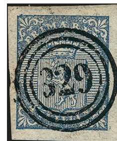
Left, Sc. 1 with numeral "194" (Loiten) manuscript cancel; right, Sc. 1 with numeral "329" handstamp cancel