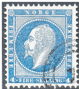
1856 4sk, Sc. 4

The previous stamps were never wholly satisfactory to the Norwegians, partly because they bore the head of a Swedish King and partly because they were not of domestic manufacture. In 1862 the Norwegian Postal Department considered new designs and entered into a contract for a new issue with Schwenzen's Lithographic Works of Kristiania at a price of 30sk per thousand.