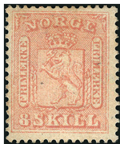
The 8 and 24sk were the first values of this set placed on sale on August 31, 1863. The 4sk followed in January, 1864, the 2sk in 1865 and the 3sk in 1866, stocks of the previous issue being used up before the new ones were placed on sale. The 3sk was not in use more than two years and is the scarcest of the set. The 24sk unused is fairly common as here were 491,000 of them in a lot of remainders sold in November, 1913.

Full details of the differences between these four types are available in publications for those desiring them. As to the cause of the varieties and their similarity in pairs Mr. W. A. S. Westoby, in the Adhesive Postage Stamps of Europe , says it appears probable that two separate engravings or drawings were made of the portion of the design that is common to all the values. From these transfers were taken and arranged in blocks of four. The values were then added and the four designs were touched up generally. Twenty-five transfers of this finished block of four were laid down on the lithographic stone which was then ready for printing. But the main stumbling block is why were two original engravings or drawings necessary where one should suffice?