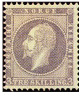
1857 3sk, Sc. 3