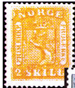
1867 2sk, Sc. 12

4sk were printed on a thinner paper with no watermark at all. The perforation was 14-1/2 x 13-1/2. The 8sk was issued about October, 1867, and the 1