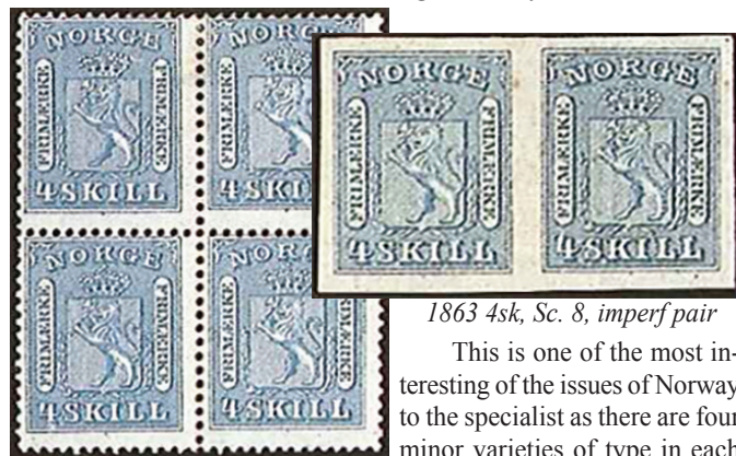
1863 4sk, Sc. 8, imperf pair

This is one of the most interesting of the issues of Norway to the specialist as there are four minor varieties of type in each value, and as there were two plates of the 4sk there are eight varieties of this denomination. The stamps were lithographed in sheets of 100 composed of twenty-five blocks of four. These blocks are all identical, but the four stamps of the block all differ slightly from one another. It is to be noted, however, that the blocks can be further divided into two groups, num-