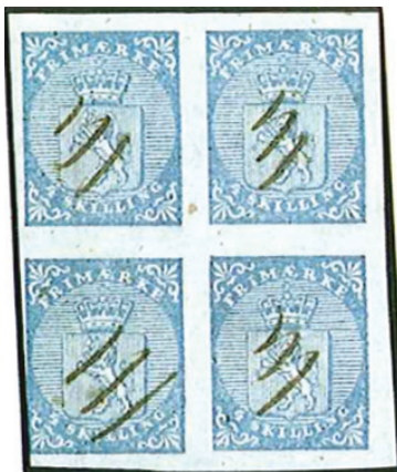
The only known block of four with a pen cancellation.

In January, 1856, it was "decided that the cancellers which are used to obliterate postage stamps shall be engraved with a numeral so that each cancellation stamp shall bear its own special number." This was of course the three concentric rings enclosing a number, the numbers running up to 383. Finally a circular announced that from January 1, 1859, "all postal stations which are furnished with date-stamps shall cancel every letter with the time and date of postage in such manner that the date cancellation shall obliterate the postage stamp." As the first stamp had been superseded by a second issue toward the end of 1856, one would not look for postmarks on the earlier stamp, yet they are not rare and show by their dates that they were used thus in spite of regulations during the years of their issue.