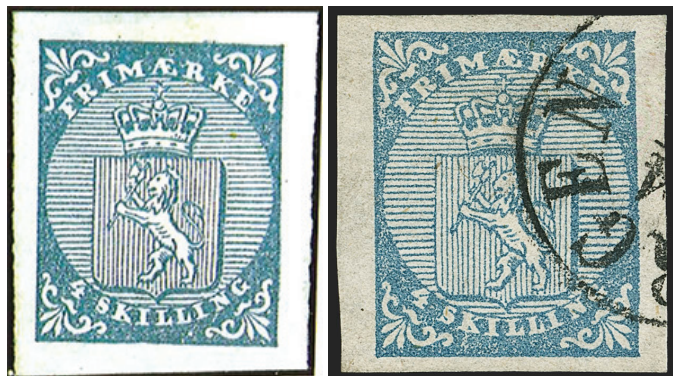
Left, an 1855 4sk (Sc. 1), mint with original gum, regarded as the finest known example; right, a magnificent used example.

by Clifford A. Howes ( From Mekeel's Weekly, August 6, 1928 with images added )