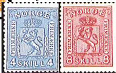
1867 4sk, 8sk, Sc. 14, 15

4sk were printed on a thinner paper with no watermark at all. The perforation was 14-1/2 x 13-1/2. The 8sk was issued about October, 1867, and the 1