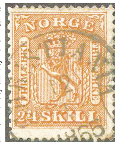
1863 24sk, Sc. 10

A decree of February 7, 1864, fixed the highest value at 24sk leaving the other values to be determined by the postal authorities, who made no change in the values already in use. The design reverted to the arms of Norway now properly shown with shield and crown. The paper was similar to that of the previous issue with marginal watermark only. The perforation gauges 14-1/2 by 13-1/2 and was done by a machine procured in England.