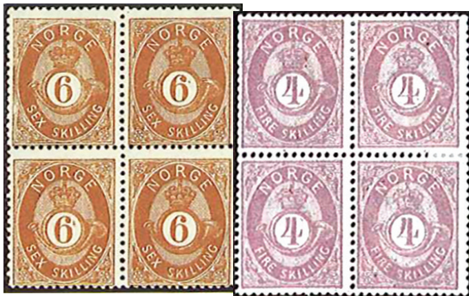
1872-75 6sk, Sc. 20, block of 4

printed on a thinner paper with no watermark at all. The perforation was 14-1/2 x 13-1/2. The 8sk was issued about October, 1867, and the 1 and 3sk in May, 1868.