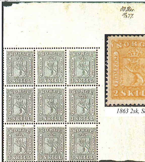
1863 3sk, Sc. 7, corner margin block of 9