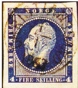
Sc. 4a, the 1856 4sk imperf