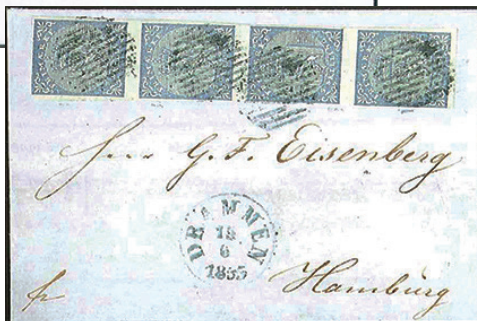
Sc. 1 vertical strip of four tied by an 11-bar blue grid on a folded cover with Drammen 15.6.1855 c.d.s.