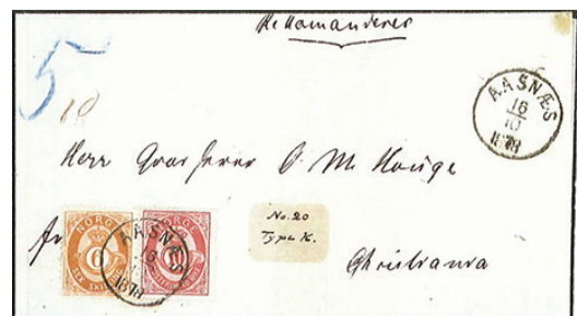
1878 Registered cover with 6sk used as 20 ore and 1877 20o (Sc. 20, 27) tied by Aasnaes Oct. 16, 1878 cds.

clichés for repairs and reserves. The new clichés were mixed in with the old ones to the number of 31, the greatest number of any one variety being four so this setting has been termed plate II. The 1sk also comes in two settings, known as plates I and II, but they are simply different arrangements of the same varieties.