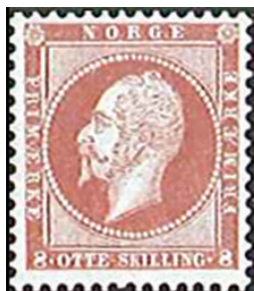
1856 8sk, Sc. 5

A decree of February 7, 1864, fixed the highest value at 24sk leaving the other values to be determined by the postal authorities, who made no change in the values already in use. The design reverted to the arms of Norway now properly shown with shield and crown. The paper was similar to that of the previous issue with marginal watermark only. The perforation gauges 14-1/2 by 13-1/2 and was done by a machine procured in England.