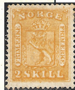
1863 2sk, Sc. 6