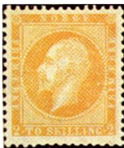
1857 2sk, Sc. 2