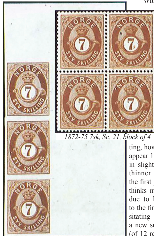
1872-75 7sk, Sc. 21, block of 4

subsidiary "die," thus making 120 cliches of which only 100 were necessary for making up the printing plate, leaving 20 in reserve to replace any damaged in use. One might think that the strip or block of cliches made up from the subsidiary "die" would be used thus in making up the plate, but it is evident from the irregular distribution of the varieties over the printed sheet that it was cut up into separate cliches in each case.