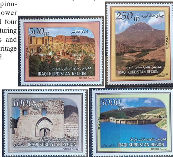
2009, Iraqi Kurdistan sights

In 2010 there were stamps for the World Post Day, for the 112th anniversary of a Kurdish newspaper, and two other stamps (caves, and women in front of outhouse).