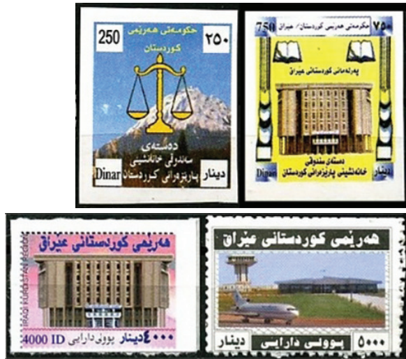
Second issue revenue stamps, 2009

Unfortunately, I haven't been able to find any Kurdish stamp issues 2006-08, but in 2009, a stamp for the qualifications for the Asian U-19 soccer championship, a flower stamp, and four stamps featuring landscapes and cultural heritage were issued.