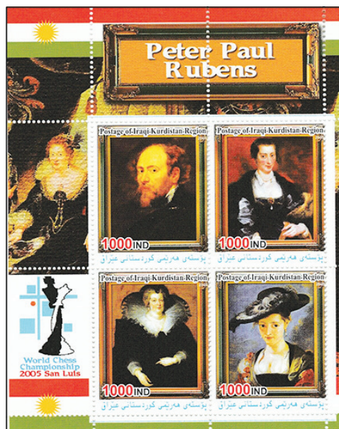
2007 Illegal souvenir sheet

A number of minisheets featuring famous paintings came on the market in 2005, but these did not originate with the Kurdish authorities but from a producer of fraudulent stamps that were marketed on Delcampe and eBay.