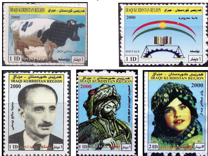
Left to right, top row first: Agriculture, Cow; Kurdish broadcasting (1 of 4 stamps); Personalities (one of six); Headgear (2 of 13 stamps)

In 2000 there was a series of 10 stamps with agriculture as theme and 13 stamps with Kurdish headgear as motives. There also were four stamps with technology and engineering as theme and six stamps featuring Kurdish personalities. A souvenir sheet was also released in 2000, with six different 1999 and 2000 stamps.