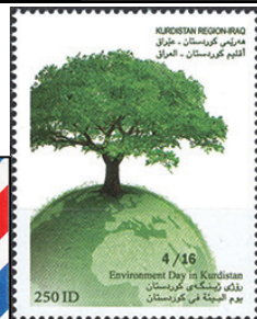
2016, Environment Day