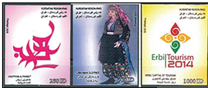
2013: Alphabet, costume, tourism

I do not know of stamps issued 2014-15, but from 2016 I know a stamp for the Kurdish Environment Day April 16.