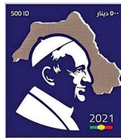
Essay for unissued papal visit stamp

the visit, but when images of the planned issue were published, the Turkish government protested as the essay showed a map of all Kurdistan, including Turkish Kurdistan, and the stamp was never issued.