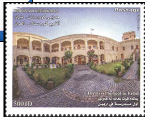
2017, first school in Erbil