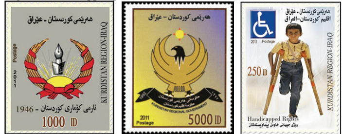
2010, arms of shortlived 1946 Kurdish state; Arms of self-government region; Rights of handicapped persons

The flag and arms of Kurdistan from 1946 to present day were presented on two 2011 stamps, and there was a 2011 stamp stressing the rights of handicapped persons.