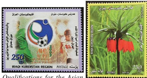
Qualifications for the Asian U-19 soccer championship

Unfortunately, I haven't been able to find any Kurdish stamp issues 2006-08, but in 2009, a stamp for the qualifications for the Asian U-19 soccer championship, a flower stamp, and four stamps featuring landscapes and cultural heritage were issued.