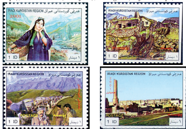
2001, new motifs