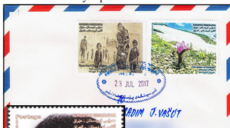
Above, 2017 cover, the left stamp being a charity issue

I do not know of stamps issued 2014-15, but from 2016 I know a stamp for the Kurdish Environment Day April 16.