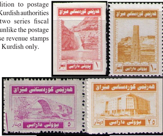
First issue Kurdish revenue stamps (2001-2002)

In addition to postage stamps, the Kurdish authorities have also two series fiscal stamps and unlike the postage stamps, these revenue stamps have text in Kurdish only.