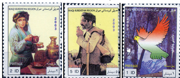
2003, new motifs

Daily life in Kurdistan was illustrated on nineteen 2001 stamps, and in 2003 stamps depicting everyday people as well as stamps depicting politicians were issued. In addition a stamp showing Sheikh Mahmud, and