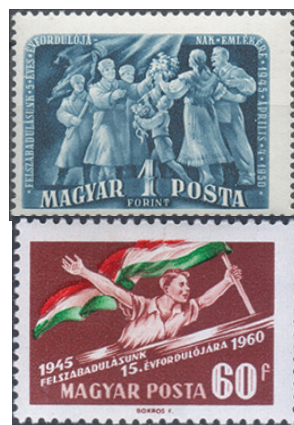
Top to bottom: 1950 liberation 5 years Sc. 887; 1960 liberation 15 years Sc. 1325; 1975 liberation 30 years Sc. 2353

ary, and nine stamps marked the 20th anniversary in 1965. In 1970, a miniature sheet celebrated the 25th anniversary of the 'liberation', and in 1975 the 30th anniversary was remembered on five stamps. The 35th anniversary in 1980 got a single stamp as did the 40th anniversary in 1985.