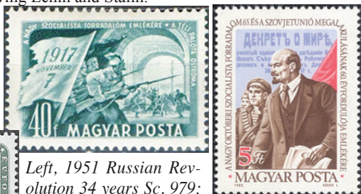
Left, 1951 Russian Revolution 34 years Sc. 979; 1982 Russian Revolution 65 years Sc. 2768

The 35th anniversary of the Russian Revolution was commemorated on three