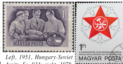
Left, 1951, Hungary-Soviet Amity, Sc. 934; right, 1978, Hungarian Communist Party 60th Anniversary. Sc. 2553

The second congress of the Hungarian Communist Party was publicised with four 1951 stamps, and there were two 1951 stamps for Hungarian-Soviet Amity. The third congress of the Communist Party was publicised with a single 1954 stamp, and in 1958, the 40th anniversary of the Hungarian Communist Party was celebrated on two stamps. The 60th anniversary was remembered on a 1978 single.