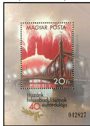
1985 liberation 40 years Sc. 2914

Between 1951 and 1958 17 stamps of the first Rebuilding Plan were is-