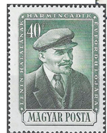
1954 Lenin 30th death anniversary Sc. 1073

1952 stamps with portraits of Marx, Engels, Lenin, and Stalin. The 65th anniversary got a single 1982 stamp showing Lenin. The 30th death anniversary of Lenin was remembered on three 1954 stamps