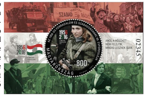
2016 69th anniversary of 1956 uprising

ple's Republic, a stamp was issued for the 35th anniversary of Uprising. There were also four 1996 stamps and a souvenir sheet for the 40th anniversary of the Uprising and one of the stamps had a portrait of Imre Nagy. In 2016 Hungary issued a souvenir sheet for the 69th anniversary of the Uprising. In 2018, Roma heroes of the Uprising were remembered on ten 2018 stamps.