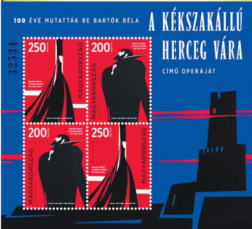
2018 Bluebeard's Castle by Bartok

Next Month: Hungarian Republic 1989-present