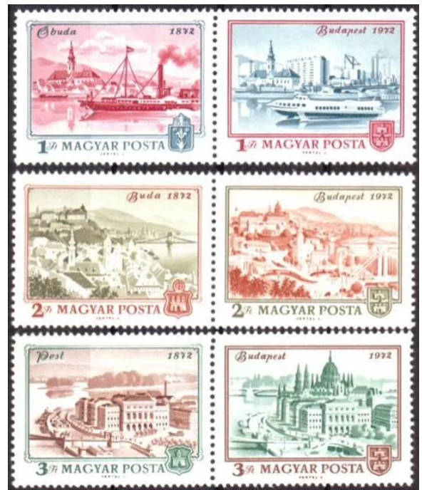
Above, 1972 unification of Buda and Pest Sc. 2179-84; right, 1977 Sopron 700 years Sc. 2490

The centenary of the unification of Buda, Obuda and Pest as Budapest was commemorated with six stamps in 1972. In 1977 the 700th anniversary of Sopron was celebrated on a single stamp.