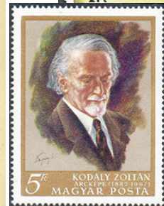
Left, 1982 Kodaly Sc. 2775; right, 1968 Kodaly Sc. 1888

For his birth centenary in 1982 a single stamp was again issued. The 40th anniversary of his death was the theme of a 2007 stamp, and the 50th anniversary with a 2017 stamp.