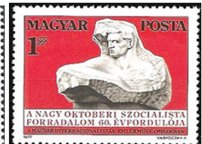
Left to right, top row first: 1968 Communist Party 50 years Sc. 1938; 1968 Marx Sc. 1898; 1974 Lenin Sc. 2269; 1977 60 anniversary of Russian Revolution Sc. 2506