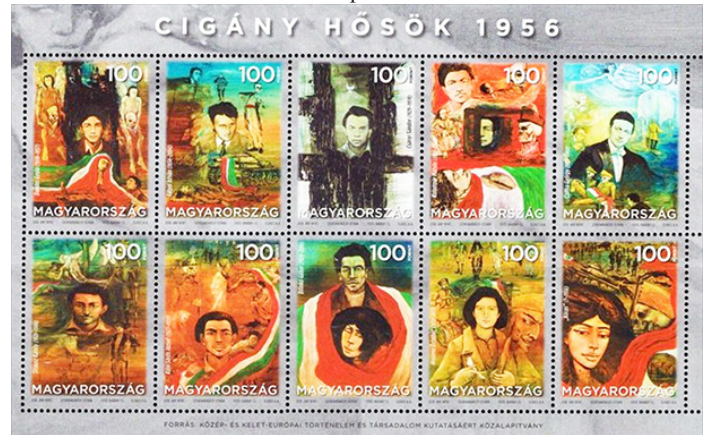
2018 Roma heroes of 1956 uprising