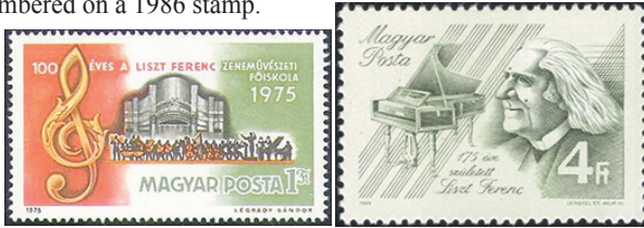
Left, 1975 Liszt Academy Sc. 2385; right, 1986 Liszt Sc. 3003

orated on a single 1975 stamp. The 175th anniversary of Liszt's birth was remembered on a 1986 stamp.