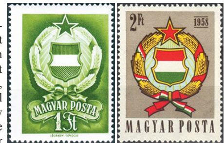
New state arms: left, 1957, Sc. 1172; right, 1958, Sc. 1192

Although the uprising was crushed by Soviet forces, the Hungarian communist government did make some changes, for instance the national arms was changed already in 1957, substituting the hammer and grain ear with the national colors; red, white and green. The new arms were displayed on two 1957 stamps, and on three 1958 stamps for the first anniversary of the new constitution.