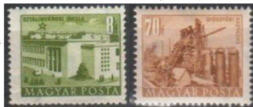
1951-53 Rebuilding Plan Sc. various