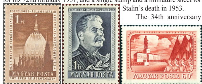
1954 5th anniversary of constitution Sc. 1087; 1949 Stalin 70 years Sc. 864-66; 1951 Stalin 72 years Sc. 982-83

The fifth anniversary of the constitution of the People's Republic was celebrated on three 1954 stamps. The Soviet influence was strong and in 1949, three stamps were issued to celebrate Soviet leader Stalin's 70th birthday. There were also two stamps for his 72nd birthday 1951, and a single stamp and a miniature sheet for Stalin's death in 1953.