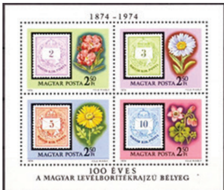
Top to bottom: 1971 centenary of Hungarian stamps Sc. B288; 1971 centenary of Hungarian stamps Sc. B289-92; 1974 centenary of envelope design Sc. 2281

The centenary of the unification of Buda, Obuda and Pest as Budapest was commemorated with six stamps in 1972. In 1977 the 700th anniversary of Sopron was celebrated on a single stamp.