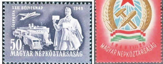
Left, 1949 Stamp Day Sc. C67; right, 1949 arms of People's Republic Sc. 857

August 18, 1949, the Hungarian People's Republic was established and two days later three stamps displaying the arms of the Communist republic were released. This set was inscribed "Magyar Népköztársaság" (Hungarian People's Republic). The 1949 Stamp Day single had the same inscription; all other stamps of the People's Republic were inscribed "Magyar Posta".