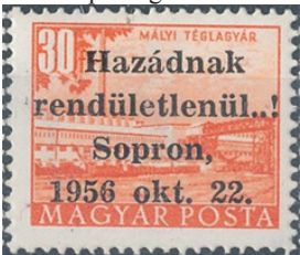
1956 Sopron issue

During the revolution, 21 Hungarian stamps in Sopron were overprinted, "Hazádnak rendületlenül...! Sopron, 1956 okt. 22" (They get home steadfast...! Sopron October 22, 1956). Few