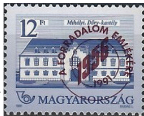
1991 35th anniversary of 1956 uprising Sc. 3320

ple's Republic, a stamp was issued for the 35th anniversary of Uprising. There were also four 1996 stamps and a souvenir sheet for the 40th anniversary of the Uprising and one of the stamps had a portrait of Imre Nagy. In 2016 Hungary issued a souvenir sheet for the 69th anniversary of the Uprising. In 2018, Roma heroes of the Uprising were remembered on ten 2018 stamps.