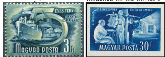
1950 5-year plan Sc. 881; 1951 1st Anniversary 5-year plan Sc. 969

In 1950 Hungary launched a 5-year plan modelled on the Soviet 5-year plan, and