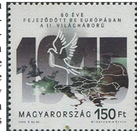
2005 end of WWII 60 years Sc. 3930

The 5th anniversary of the 'liberation' (Soviet intervention) was the theme of four 1950 stamps, and in 1955, four stamps were issued for the 10th anniversary of the 'liberation', and in 1960 two stamps celebrated the 15th anniversary,