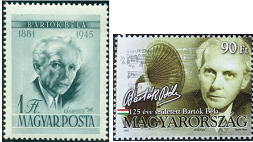
1955 Bartok Sc. C168 2006 Bartok Sc. 3990

Béla Bartók was remembered on three 1955 stamps on the 10th anniversary of his death. In 1971 he was honored with a stamp on the 90th anniversary of his birth, and again in 1981 on the centenary of his birth. He was also honored on a 2006 stamp. The centenary of his opera Bluebeard's Castle was commemorated with two 2018 stamps issued in a souvenir sheet.