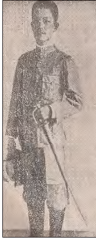
An old news photo of General Aguinaldo at the age of 29 in Cavite, when the Philippines declared independence on June 12, 1898, and he became President.