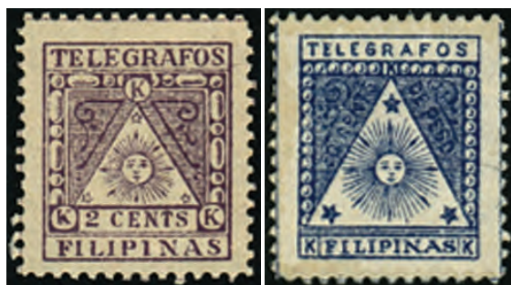
Telegraph stamp varieties, still not listed in Scott

We will also be covering the Aguinaldo issues, the history of this Revolutionary era and a controversy surrounding the leaders of the Revolution in a coming issue of Stamp News Online; to subscribe, see page 31