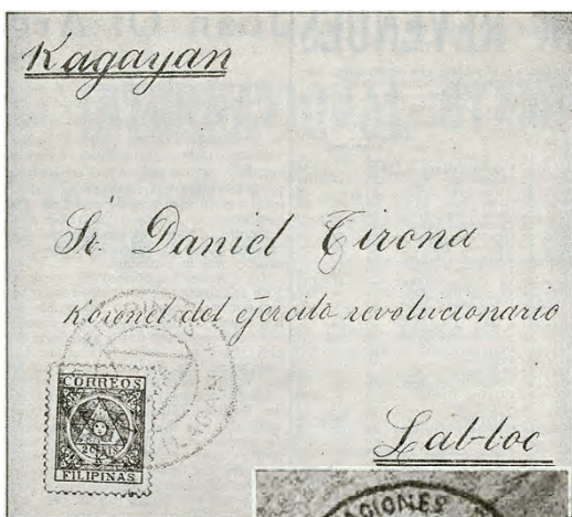
A cover addressed to the Colonel of the Revolutionary Army at Lal-loc, and the backstamp. (Illustrations from the original article.) (Illustrations from the original article.)

Then skipping pieces of cover and bits with Aguinaldo stamps and cancels thereon as they show no backstamps or other conclusive evidence of delivery, we find the 2c carmine "Correos" (without the light horizontal lines across the 2 Cents) on an entire, cancelled with a