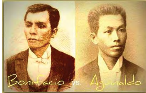
Andres Bonifacio and Emilio Aguinaldo

the National Commission for Culture and the Arts: Aside from Rizal, the only other hero given an implied recognition as a national hero is Andres Bonifacio whose day of birth on November 30 [Bonifacio Day] has been made a national holiday. [Jose Rizal, the most prominent advocate