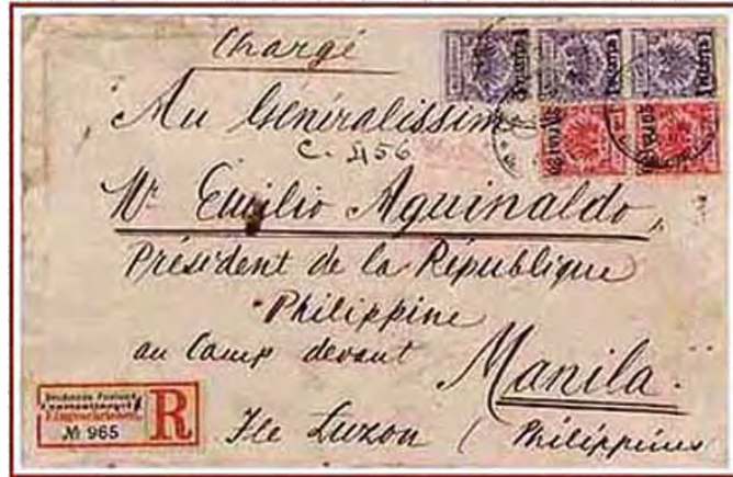
A Registered cover from the German Offices in Manila to Aguinaldo as President of the Republic. Markings include, on the back, "Mil. Sta. No. 1, Philippine Isles / San Francisco, Cal., Registered / May 8, 1899".