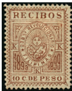
Revenue stamp, not mentioned in Scott

[That same year, Scott added the Aguinaldo issues. They are listed in the