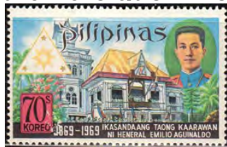
Sc. 1012 pictures Aguinaldo and the Shrine

The Aguinaldo Shrine, in Cavite, is the ancestral home of Emilio Aguinaldo, the first president of the First Republic of the Philippines. It was here that Philippine independence from Spain was proclaimed from a window of the home on June 12, 1898. The Philippine flag is raised here by top national officials every June 12 to commemorate Araw ng Kalayaan (Independence Day).