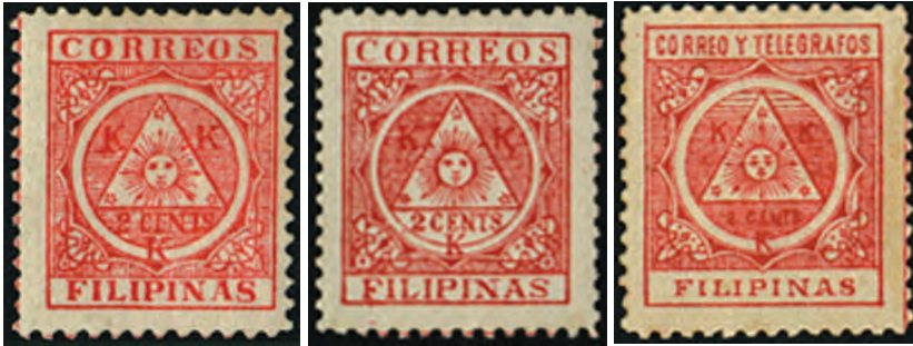
Left, Sc. Y1, "2 cents" against red background; center, Sc. Y2, "2 cents" against clear background; Sc. Y3 "Telegrafos" 2 cents

by J. W. Longnecker ( From Mekeel's Weekly, January 25, 1937, with images added )