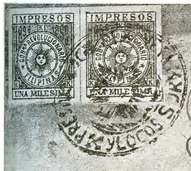
A pair of newspaper stamps with cancel on part of cover. (Illustration from the original article.)

This cover with its story that I cannot read was addressed to the telegraph operator at Batangas. The stamps are cancelled by a "Mil. Sta. No. 1 Philippines Isls—San Francisco, Cal." circular postmark, dated Jan. 1, 1899. On the face of the cover has been rubber stamped "Postage Due 2 Cts.". I venture the opinion that this was placed by the United States postal authorities, as it looks familiar. The cover is backstamped with Military Station No. 1, Manila, Philippine—Received. This backstamp is dated April 5, 1900. I would like to know, just to satisfy a collector's driving curiosity, where that letter spent that year and three months and why.