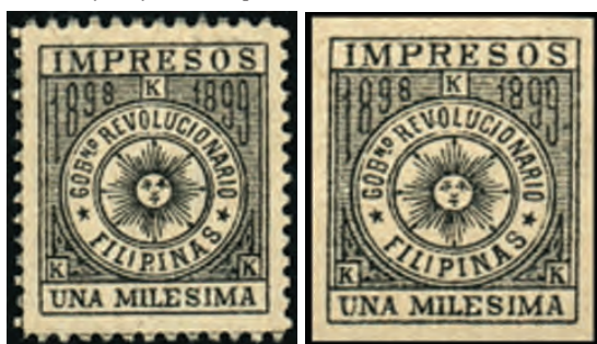
Newspaper stamp, perf and imperf, Sc. YP1 and YP1a