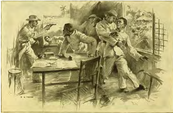
The capture of Aguinaldo, March 22, 1901.*

“For at least ten months, the Filipinos were under control of neither the Spanish or American Authorities, but acknowledged the leadership and presidency of Aguinaldo. His Revolutionary Government had become recognised throughout the islands, except for Manila and some sea-ports.... In those ten months, civil governments were established, a native army was organised, telegraph lines which had