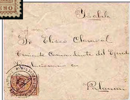
10c Revenue (Recibos) issue used as postage, tied by "Comunicaciones Filipinas Tuguegarao" postal seal cancel, on cover to Palanan, Ysabela