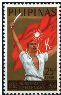
Andres Bonifacio, Sc. 900

“From being the face of the P5 bill/coin to sharing half the theme of the P10 bill, the Philippine’s other national hero, Andres Bonifacio y de Castro, has suffered a devaluation over the last few decades. Corollary to the Supremo’s apparent (and unofficial) demotion is the promotion of his revolutionary nemesis, Gen. Emilio Aguinaldo. From having absolutely no presence in neither bills nor coins, the country’s supposed First President responsible for the Proclamation of Philippine