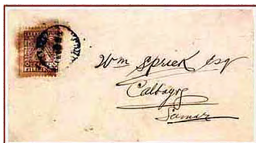
Telegraph stamp used as postage, tied to a cover to Calbayog, Samar by a Spanish period postmark. Stamp pays the single Local rate.