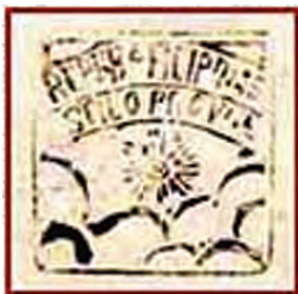
Left, a magnified view of the hand-stamp on the cover on page 21; right, the "Ilanga" backstamp